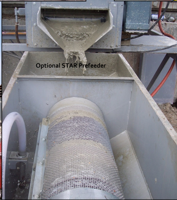
Optional STAR Prefeeder