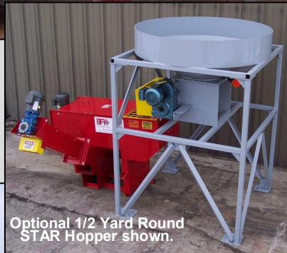
Optional 1/2 Yard Round STAR Hopper shown.